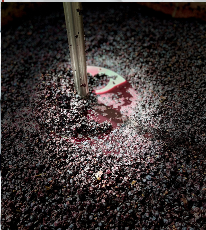
Above: Punch down of fermenting Montepulciano